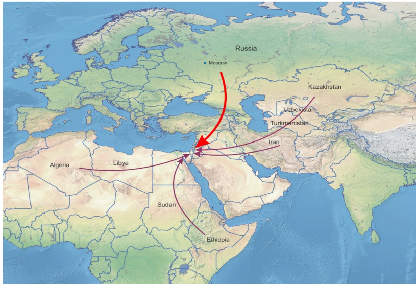
Old Testament – Jeremiah 29:4-13 - New Testament – Romans 9:22-33