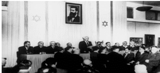
The new state of Israel was proclaimed in Tel Aviv on 14 May 1948

Once again, biblical prophecy began to make sense: